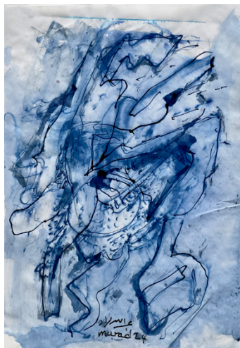
Untitled, 2024 Ink, watercolour on paper 29,5 x 18 cm