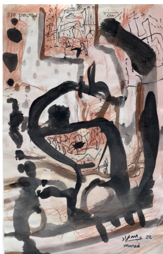
Untitled, 2022 Ink, gouache on paper 38 x 24,5 cm