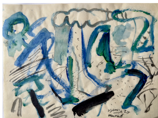
Untitled, 2024, ink, gouache on paper, 24,5 x 32 cm