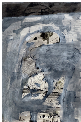
Untitled, 2018 Ink, gouache on paper 29 x 20 cm