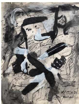
Untitled, 2021 Ink, gouache on paper 33 x 24,5 cm