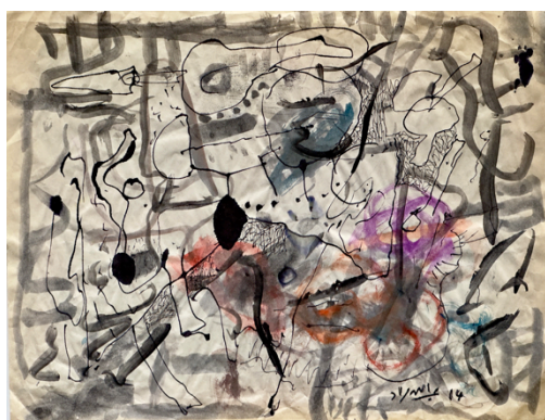
Untitled, 2014, Ink, gouache on paper, 33 x 24,5 cm