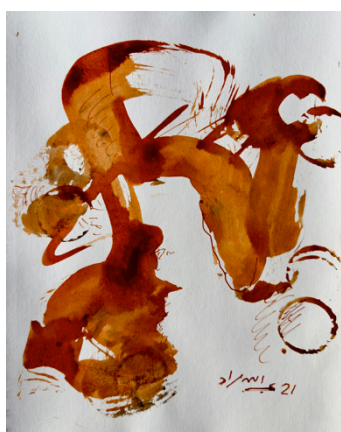
from sketchbook, 2021 Untitled, Acryl on paper 30,5 x 24,5 cm