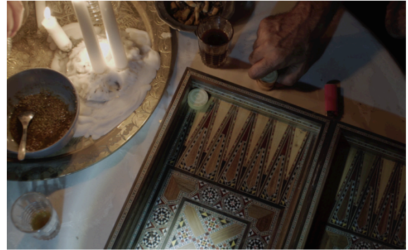
Rand Abou Fakher

Recapturing our youth | 2023 Acryl on Canvas | 59 x 70 x cm