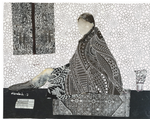
Oroubah Dieb , from: Collages Confinés , 2020, mixed technique; 20,5 x 26,5 cm, private collection Paris